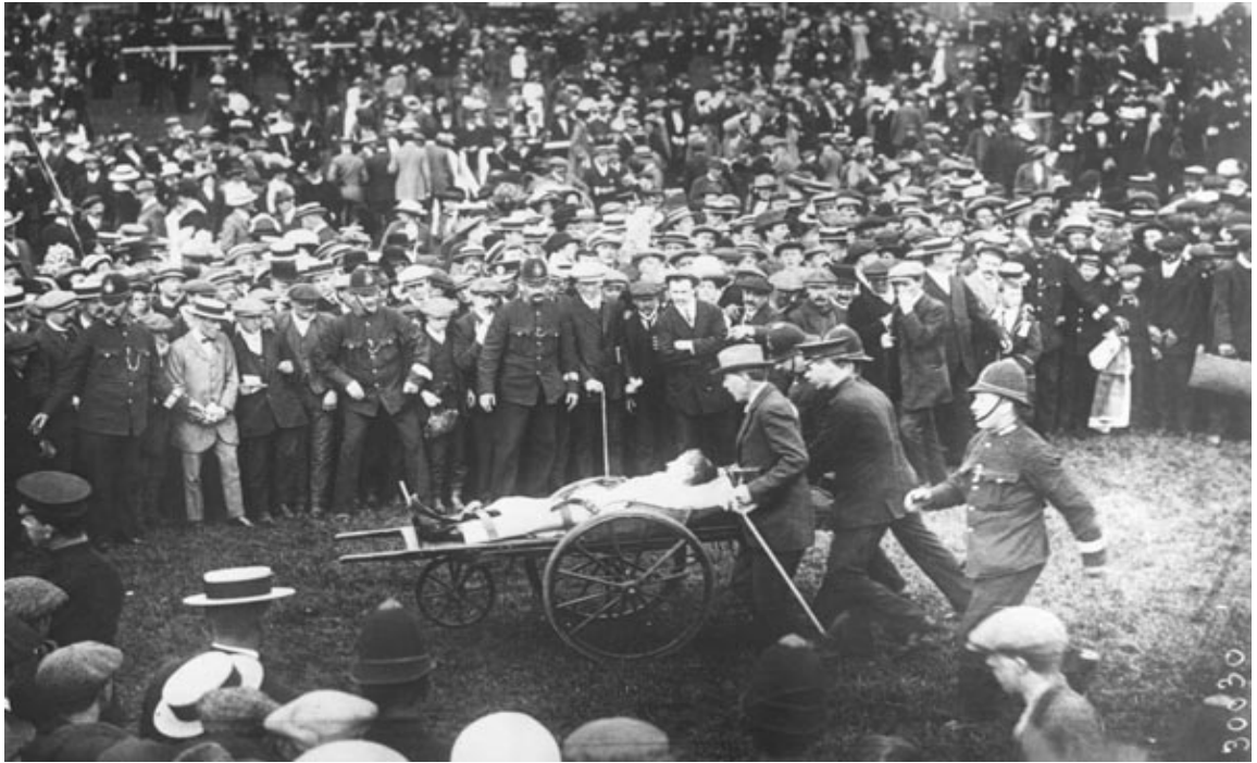
Compiled by Norman Bambridge Basildon Borough Heritage Society March 2025