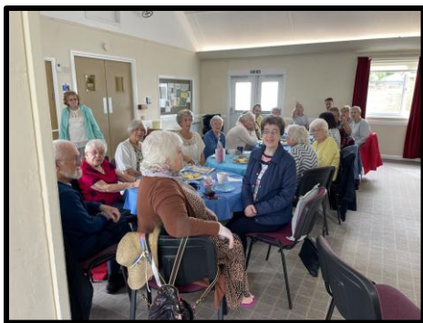
Ingaway Church Members

She attended Lee Chapel South Junior school, also attend Basildon College. Her acting career started at the age of eleven. If you would like to read more about her career to date, suggest you get a copy of Basildon's Famous People – Volume two.