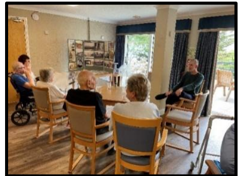
Just a few of the residents

On the 13 th September we gave a talk to around ten residents, of the care home on the history of Basildon including a few famous people. It was a most enjoyable session with a considerable amount of interaction.